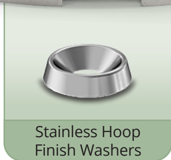
Stainless Hoop Finish Washers