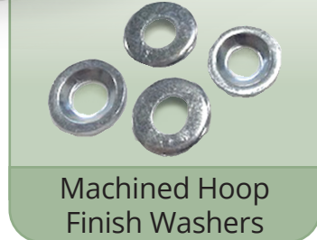
Machined Hoop Finish Washers