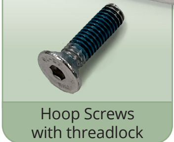
Hoop Screws with threadlock

INDEPENDENT TESTING has shown Freeman's billet aluminum hoops to be 57% STRONGER than other cast aluminum hoops on the market.